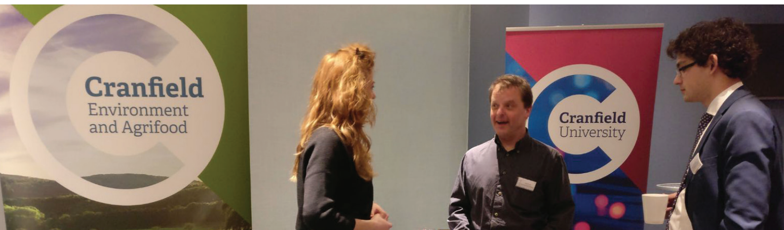
Land Condition Symposium 2018